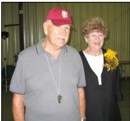
Principal & Coach