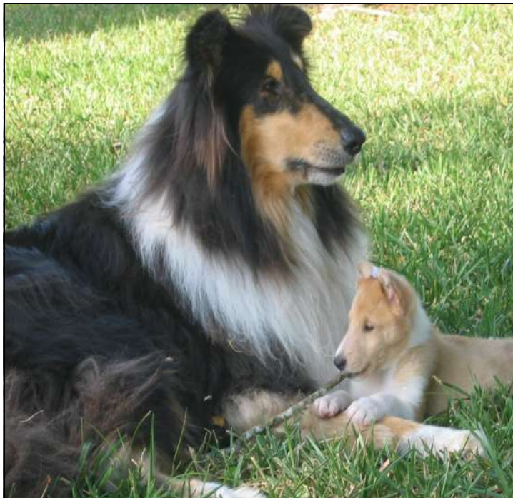
CH Ceilidh's Celtic Sabre CD RN 12/19/1998 - 9/7/2010

"The greatest thing you'll ever learn is just to love and be loved in return." This "Silly old bear" will be missed. Shirley Conley